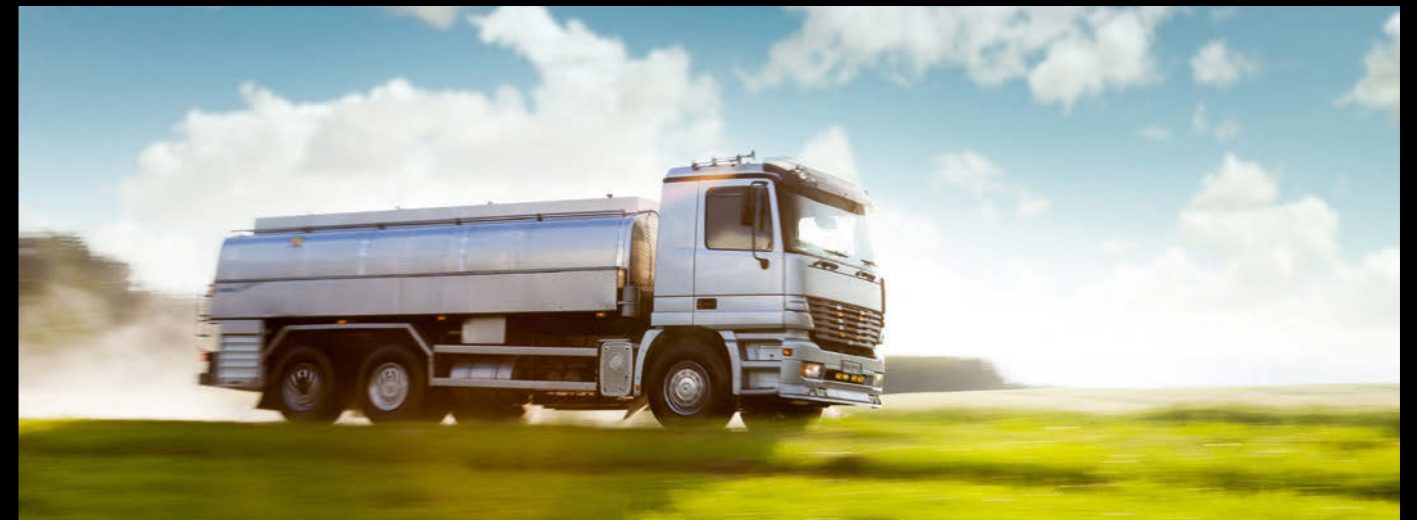
Diesel particulate filter line

We turn strong machines into clean power packs.