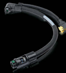
SCR hose line

Our lines for innovative Selective Catalytic Reduction (SCR) technology also offer impressively high reliability. Our systems, which are heated electrically or use cooling water and supply carbamide to the exhaust stream, are designed for diverse temperature ranges.