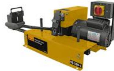
HS-501 Saw (20614557)