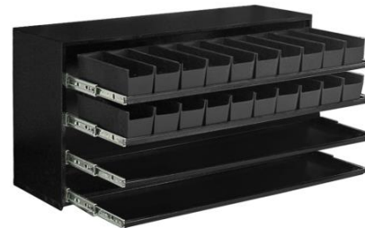
Hydraulic Fittings Bin (20240780)