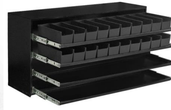
Hydraulic Fittings Bin (20240780)