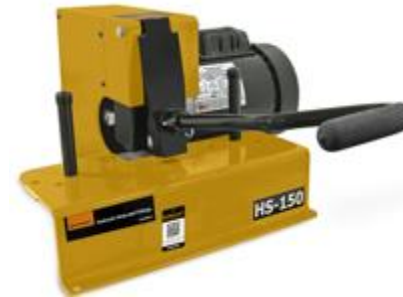
HS-150 Saw (20614553)