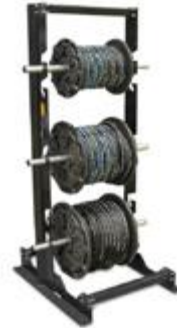
24" Hose Rack (21024821)